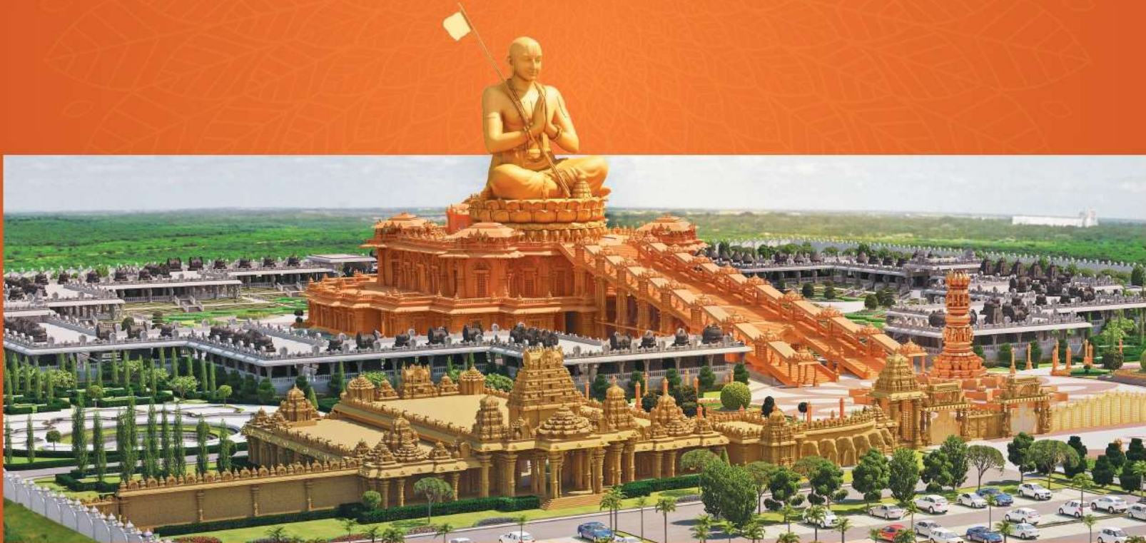
Spectacular panoramic view of Samatha Murthy, Statue Of Equality with the magnificent 108 Divya Desas, Divine Places Of Inspiration