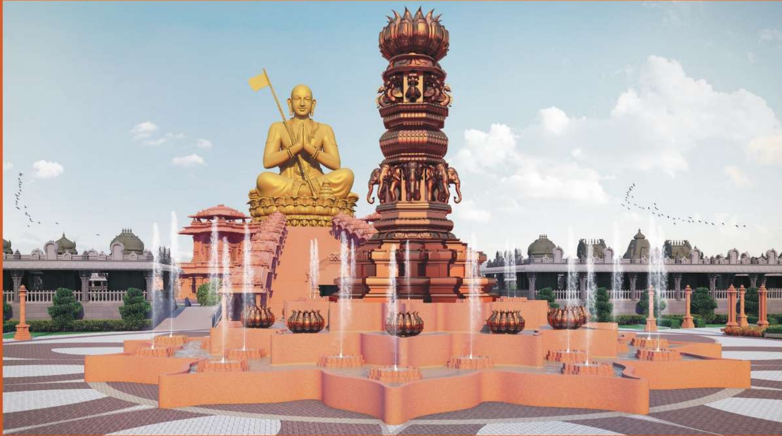
This Dynamic Fountain, pays obeisance to the Statue Of Equality of Sri Rama:nuja:cha:rya

The purity of his heart, convinced His mentors, rulers, bureaucrats, elite and the common man to tread the path of Bhakti - Divine Love.