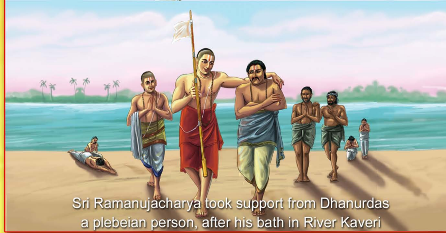
Sri Ramanujacharya took support from Dhanurdas a plebeian person, after his bath in River Kaveri

The Statute of Equality (Samatha Murthy Spoorthi Kendra) is a humble token of gratitude to the Great Guru.