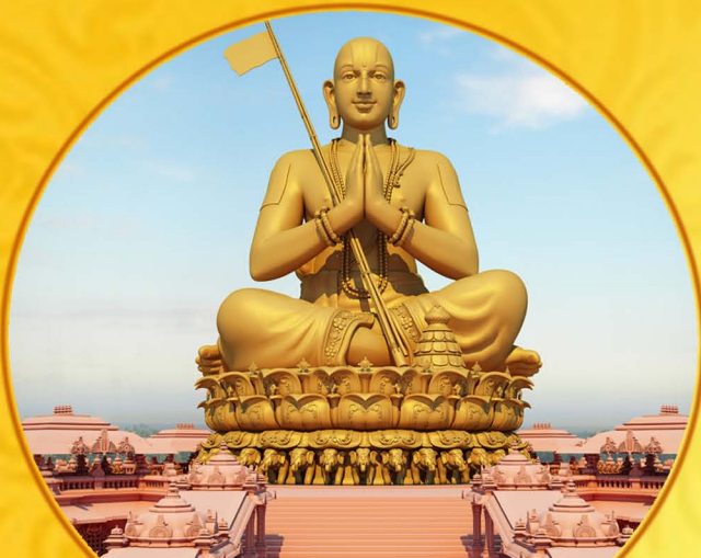
Statue Of Equality

Sri Ramanujacharya was one Great Saint who sanctified this earth during AD 1017 - 1137. Born to Sri Kesava Somayaji & Ka: nthimathi of A: suri family in Sriperumbudur village, Tamil Nadu, South India, Sri Ramanujacharya went on to become one of the greatest Philosopher, Social reformer, Spiritual guru who brought Visishta: dvaitha school of philosophy into light.